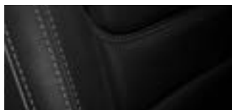
Leather, Black, Gray Stitch